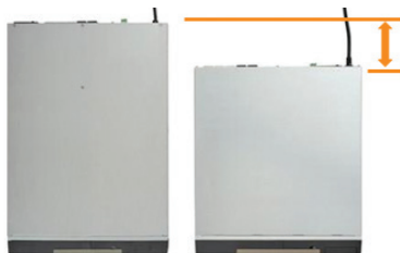
Eaton's 5P rackmount compact UPS features a shorter depth than the standard 5P UPS, providing 4-5 inches of additional clearance dependent on the model.

Extended life: Eaton's exclusive ABM® technology helps extend the life of the UPS battery.